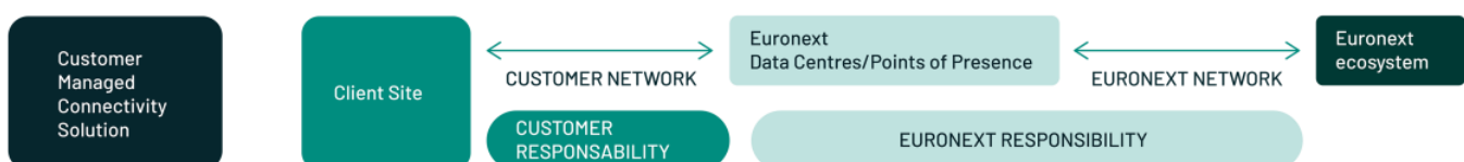
Figure 1 - Graphical View of the CMC Solution