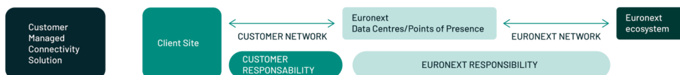
Figure 1 - Graphical View of the CMC Solution